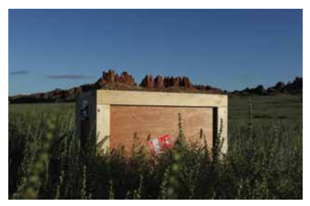
Blane De St. Croix Nomadic Landscape, 2012

in Mongolia. De St. Croix renders different facets of his experience within this removed, exotic site while using a wooden shipping crate as a sculptural pedestal. The artist reaches back to traditional modes of sculptural production to capture a miniature diorama that can be turned inward, to pack for transport, or outward so as to be set against the view of a surrounding landscape. Through this irony of presentation, Blane De St. Croix addresses pointed issues such as the maintenance of memory from distant travel experiences as well as the contrasting developments taking place within the