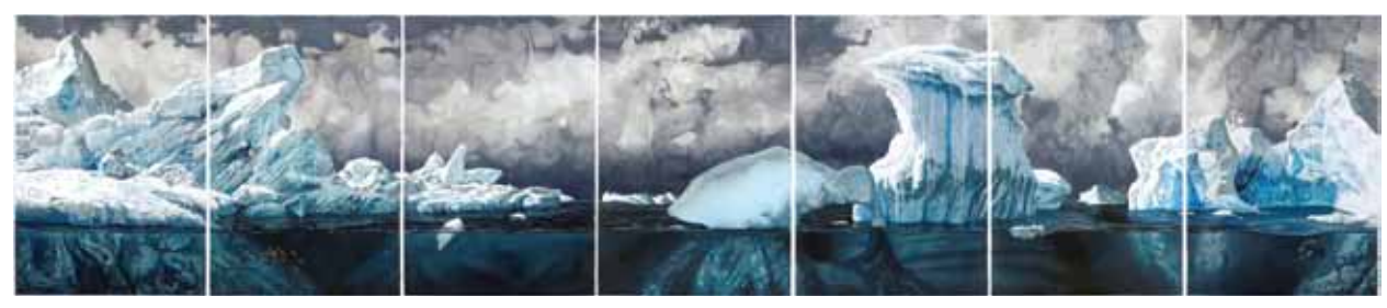
Alexis Rockman South, 2008

South (2008) by Alexis Rockman is an expansive, highly detailed portrait of the Antarctic Peninsula that stretches across 30-feet in seven panels painted with oil and wax on gessoed paper. In this colossal piece, Rockman combines the documentation techniques used in Naturalist representations with the process of traditional landscape painting in order to create a document that acknowledges this particular geographic terrain as temporary. The details are the message in this painting as the artist captures a series of anomalies that occur