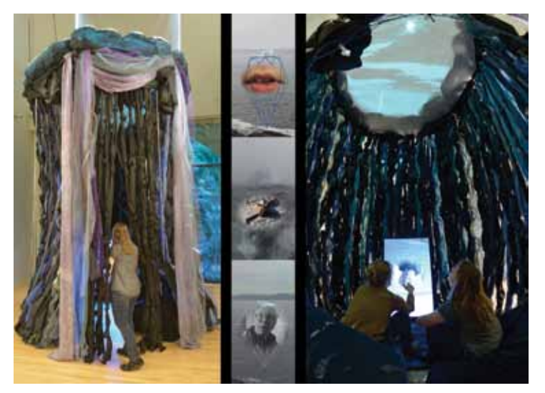
Itty Neuhaus Understory, 2013

paintings and drawings capture a vast worldview with endless, information-rich content. Ninety-Degree Draft (2009-11) consists of ten works on paper that begin with a depiction of the white continent in the middle of a field of blue. Hundreds of detailed drawings of people, places and things as well as text populate the surface of each piece creating a visual timeline of the journey.