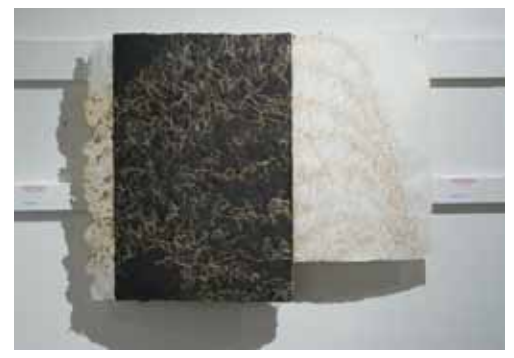
Michele Brody Drawing Roots: Sidewinder, 2012

The collage of Blane De St. Croix focuses on the 7.0 magnitude earthquake that struck the island of Haiti on January 12, 2010. This piece consists of many laser jet copies of the artist's intricate drawings that tear, fold and combine to create a 6-foot by 7-foot surface creating a swirling illusion that positions the viewer in a bird's-eye perspective, looking down upon a devastated forest. Flattened but rumpled across the wall, De St. Croix exposes various tensions that underlie literal and verbal ironies that appear frequently within geopolitical debates. As part of his process, the artist began by making several site visits where he met with educators, scientists, and medical workers. De St. Croix's renditions of landscape are the result of