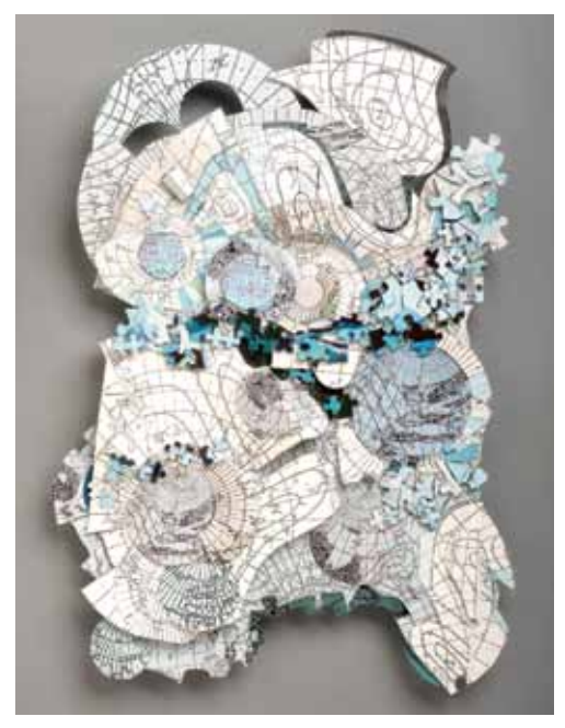
Phyllis Ewen Northern Waters #3, 2013

Beyond traveling to and pondering these extreme landscapes, photographer Scott Walden has explored the daily lives of those who live