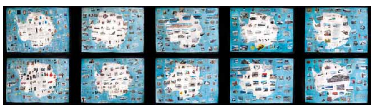
Elise Engler Ninety-Degree Draft 1-10, 2009-11

During the Austral summer of 2009/2010, Elise Engler went on a residency to Antarctica and created a vast number of drawings and watercolors that render extensive, orderly representations of every object, every person and every experience she encountered. Her object is another's subjective experience. Inhabiting the conjunction of taxonomy and natural history, Engler's infinitely voluminous